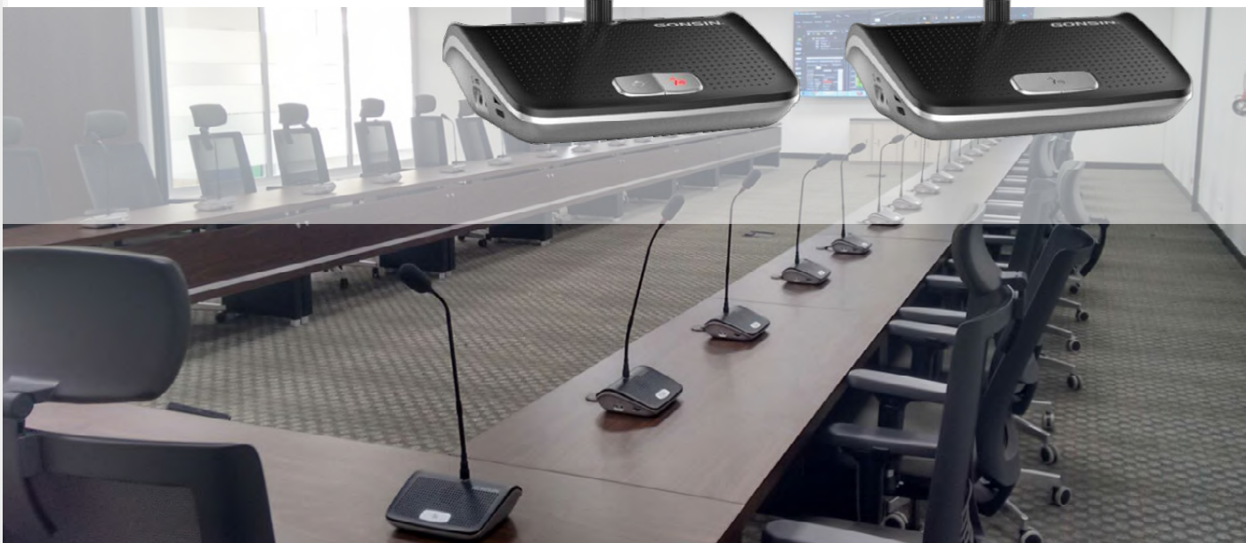
TL-VD3300 delegate unit